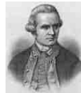
Captain James Cook

claiming of Australia for England. Given Swedenborg's international prominence at the time and the fact that Cookworthy was so involved in making Swedenborg's books accessible to English readers, it is hard to imagine that during that long journey from England that Cook, Banks and others would not have at least occasionally entered into discussion about Swedenborg and the theological ideas he expounded.