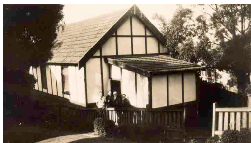
Hurstville New Church building in 1938

On 7 th October, 1930 the first and only New Church Day School opened here in the Hurstville church. It would run through 1934 with fifteen students enrolled that year. Sadly, due to events beyond anyone's control it did not reopen in 1935.