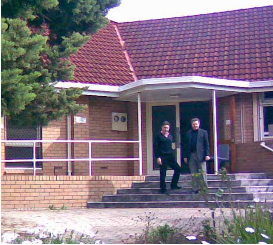
10 Broome Street (off Douglas Street) South Perth